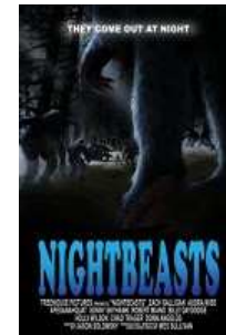
Official Movie Poster for the Upcoming Creature Feature Nightbeasts