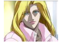
Yugo The Negotiator: Vol.4 - Russia 2 - Rebirth