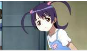
Witchblade: Volume 2