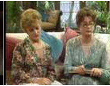
Dear Ladies: Series 1