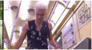
Buffy The Vampire Slayer: Season 7 Boxset