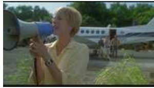
Jurassic Park III