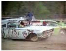
Grand Theft Auto

About This Site Meet the Team Advertise With Us Contact Us Advertising Policy Privacy Policy