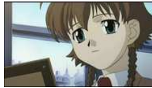
Madlax: Vol.1 - Connections