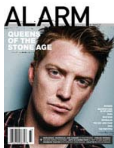
ALARM Magazine #27