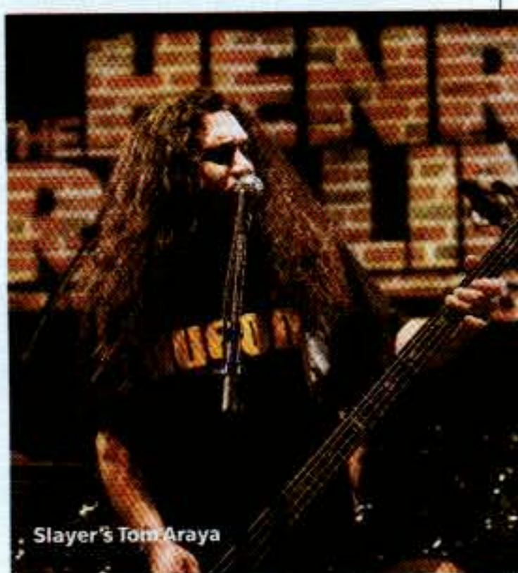
Slayer's Tom Araya

1997's BBC Studios-filmed A Case for Song attempts to wrangle several of the decade's oddball formations and his past's punkish pop into one pretty package. The Attractions? Brilliant. Turning "Pump it Up" into