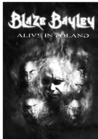
Blaze Bayley's "Alive In Poland" DVD

Metal-head vocalist Blaze Bayley, who fronted the New Wave of British Heavy Metal band (NWOBHM) Wolfsbane as well as doing a five year stint as singer for Iron Maiden, (for the albums Man On The Edge and Futureal) releases his first-ever DVD on the Metal Mind/MVD Video label titled Alive In Poland.