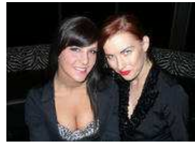
Whisper Lounge in Photos