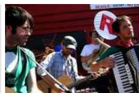
9-Piece Orchestral Punk Ensemble Coming To Rogue Bar