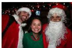
10 Things Under $10: Santarchy, Joe Strummer, and More