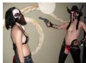
Winter Horrorland Fashion Show In Photos