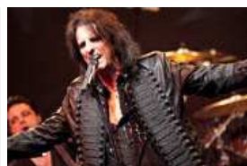
Concert Review: Alice Cooper's Christmas Pudding