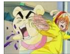
Excel Saga: Complete Collection