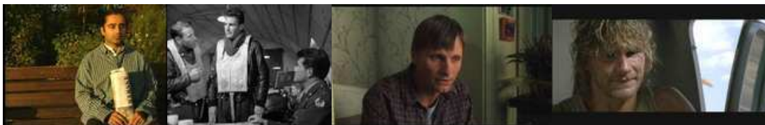
We Know Where You Live: Remix