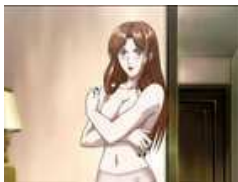
Yugo The Negotiator: Vol.3 - Russia 1- Legacy

About This Site Meet the Team Advertise With Us Contact Us Advertising Policy Privacy Policy