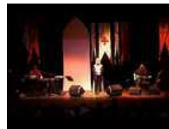
Maddy Prior - The Quest