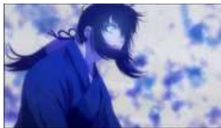
Basilisk: Vol 6