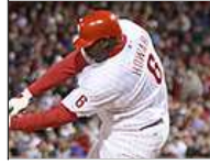
Phillies' offense feeling April chill