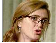
Exclusive interview with Samantha Power