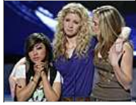
Idol Chatter blog: Who got the boot?