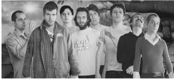
The life of any dance party: !!!.

live act of today, the band is known to dance and rock harder than the dance floor fiends in the audience, equipped with numerous percussions, funky horns and spastic dance moves à la Napoleon Dynamite .